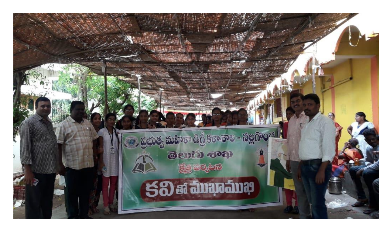
Students and faculty displaying the banner of feild trip