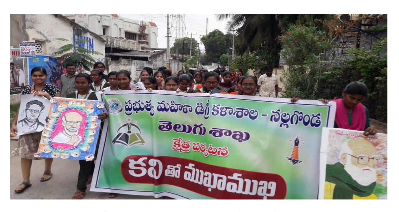
Students and faculty are headed to Venu Sankoju's house from college