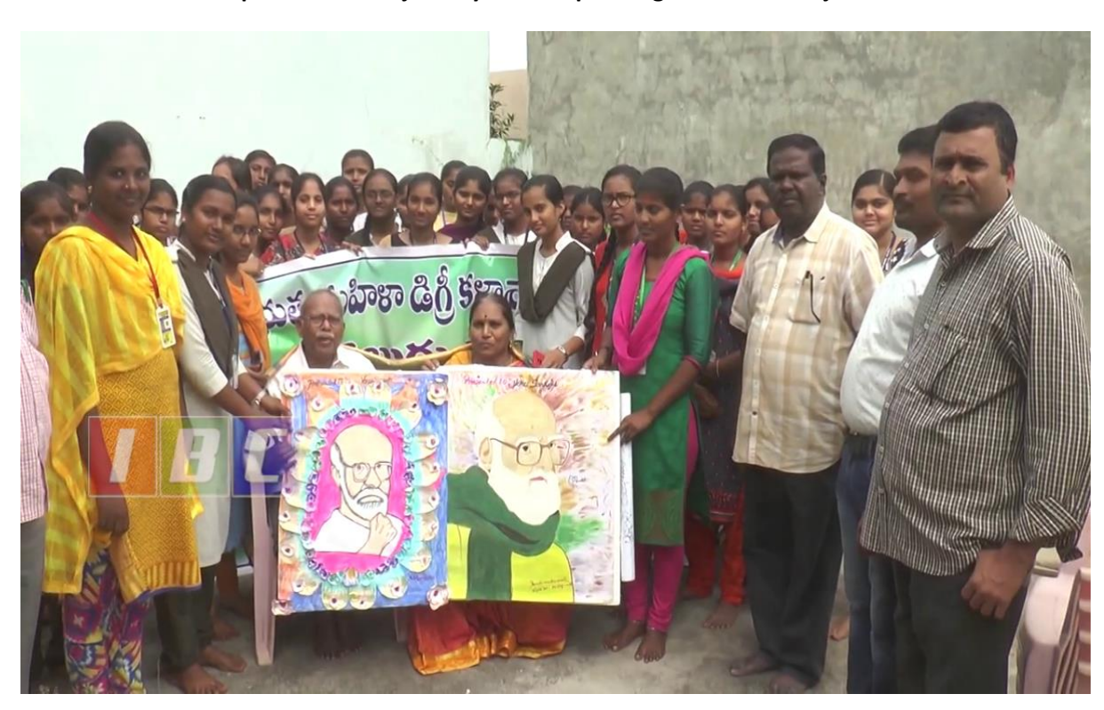
Student's and faculty Falicitated to venusankoju's couple