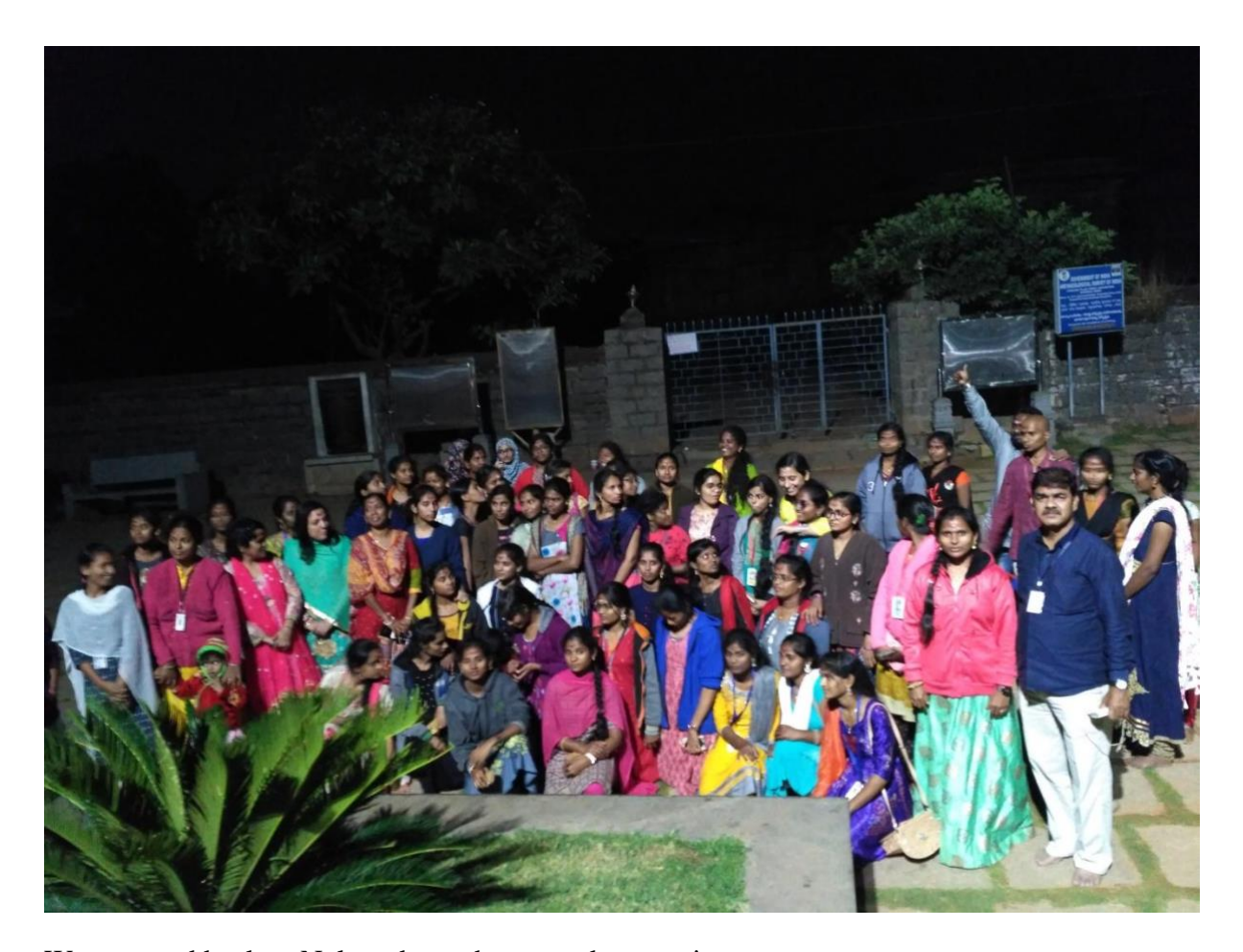
We returned back to Nalgonda on the same day evening.